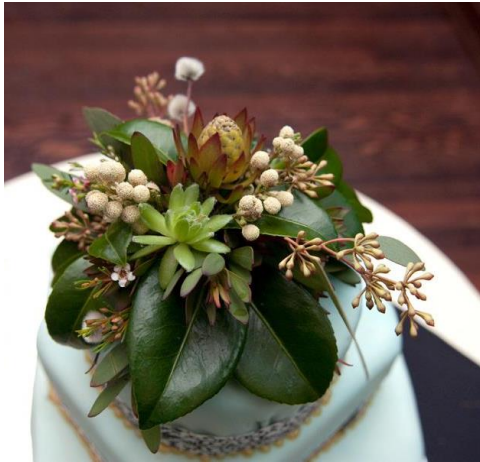
Table Centerpieces Start at $35. Most end up between $55 - $100.

(Archway) Swags Start at $150. Most end up between $250 – 400.